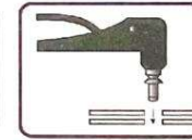
2. Slip rivet into hole