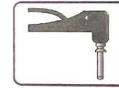
1. Slip rivet stem in nozzle